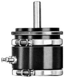
SERVO MOUNT/BALL BEARING MODEL 2501