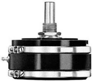
BUSHING MOUNT/SLEEVE BEARING MODEL 1822